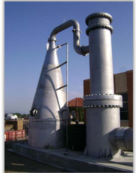
ECO 2 System before Installation