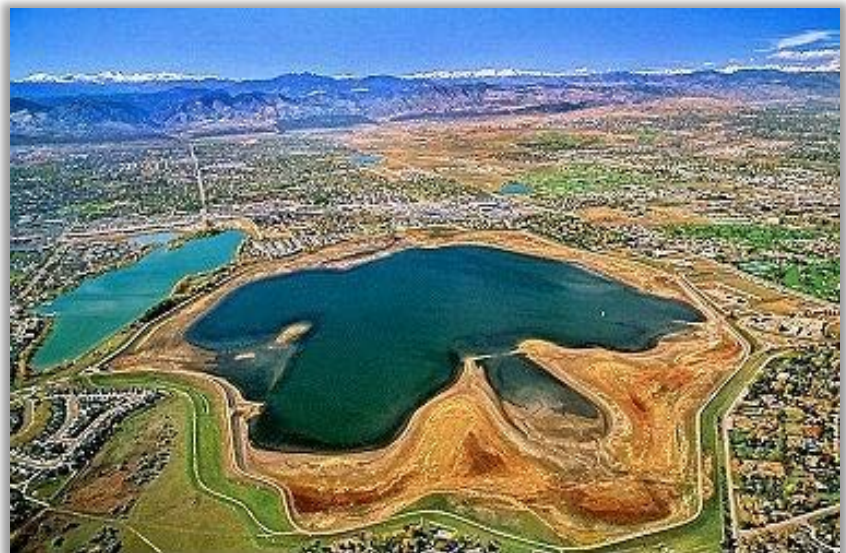
Aerial View of Marston Reservoir, Denver, CO

Denver Water takes pride in the high-quality drinking water provided to their customers and began evaluating strategies to improve water quality and reduce nutrient loadings on the WTP. After studies conducted over a period of 15 years, oxygenation using ECO 2 's Speece Cone was selected based on performance efficiencies, silent operations, and economic considerations.