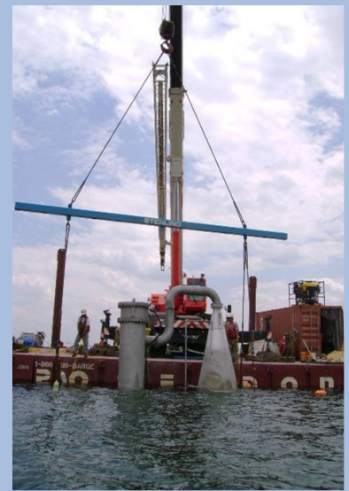
Installation of ECO 2 's Speece Cone in Marston Reservoir